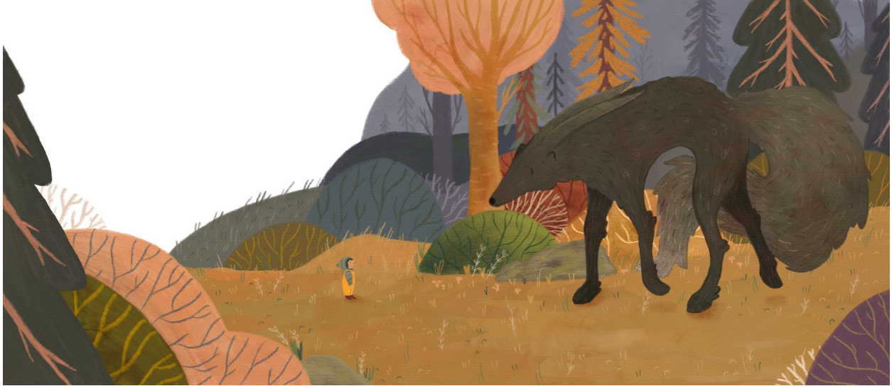
Y Soddgarw (2021) Lily Mÿrennyn

The opportunity to illustrate the book came through entering a competition with the Urdd Eisteddfod, in early 2020 before the lockdowns. The competition brief included creating pictures to accompany the text of the story. In particular, it was important to create a visual form for the creature, because images can play a major role in the way a concept or character is received. I decided to use a mixture of elements from different animals to create the Soddgarw, but the main inspiration was my three dogs. I hoped this choice would create a feeling of sympathy and familiarity towards the creature.