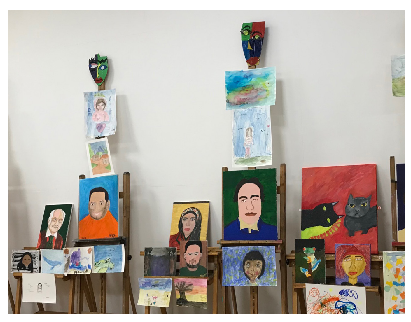
Collection of artworks by the Latin American community.

monoimpresiones y retratos. Una selección de este impresionante proyecto se exhibirá hasta finales de enero de 2025.