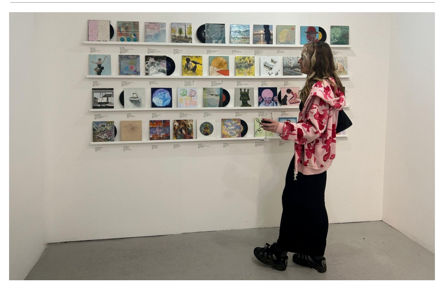
Samples of artwork from the BEEP 2024 exhibition.

Beep 2024 at Elysium Gallery presented a celebration of doomed romance, tragic events, triumphant reconciliation, love, loss and Tom Jones.